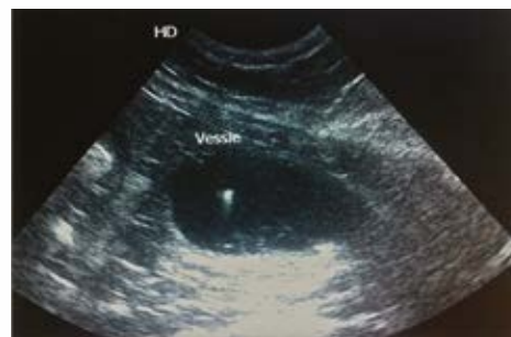
Microcalculi in suspension in the urine

The owners reported that clinical signs resolved almost immediately the diet was changed. At 1 month, ultrasound of the bladder revealed no abnormalities and whilst the urine specific gravity was still 1.050, there were no crystals observed.