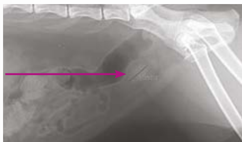
Radiograph of Bibouille at Day 0, showing a unique cystolith of 15 mm of diameter.

A diagnosis of struvite urolithiasis and urinary tract infection was made. A 10 day course of Marbofloxacin was prescribed to treat the urinary tract infection and Feline UR St/ Ox (mixture of wet and dry varieties) was given to dissolve the urolith. One month later, Bibouille had no further clinical signs. The dysuria, haematuria, soiling and incontinence had all disappeared. Radiological and ultrasound investigations were normal- the bladder stone had completely disappeared. 4 months later Bibouille was still clinically normal.