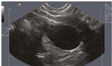
Ultrasound scan of Bibouille bladder D0+ 4 months.