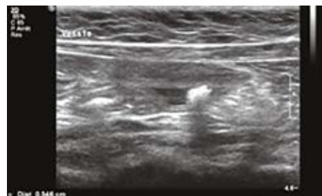
Calculus in bladder pre operatively

In conclusion, Feline UR St/Ox Urinary wet and dry are highly effective in managing all 3 common causes of FLUTD (idiopathic cystitis, struvite and calcium oxalate urolithiasis). Owners of these cases reported that both wet and dry formulas had exceptional palatability which aided compliance.