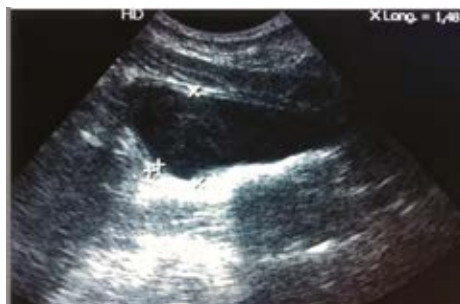
Photo 10: bladder at D0 + 2 months

The appearance of the bladder wall and urine was normal. No calculi were observed ( photo 10 ).